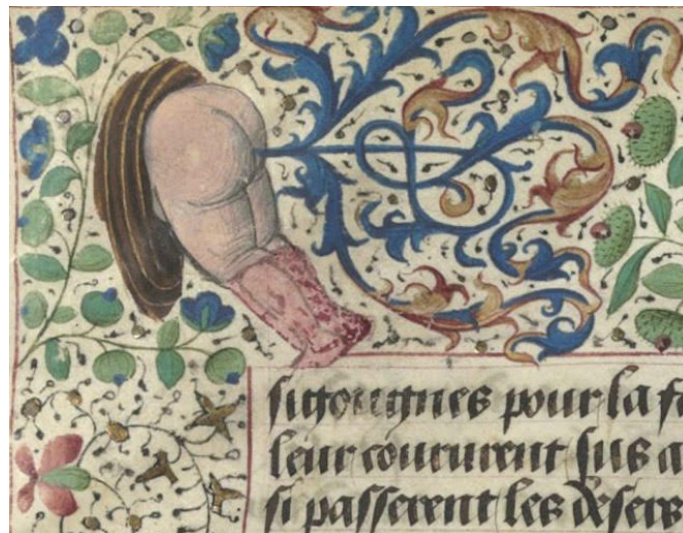
Detail from illuminated manuscript

With the concept of anal castration, Preciado asks where desire and life emerge. The anus is threatening precisely because it is sexy and productive – even reproductive, if shit is understood as manure from which new life grows. Yet that new life is not, at least in the first stage, human life. The worldview required to un-castrate the anus, to reach toward an 'anal utopia,' as Preciado has it, would require one to consider nonhuman species as part of an ecosystem in which shit is essential food rather than toxic waste. 'The community of closed anuses is shored up with dumb columns made of families, with their anally-castrated-father and their hollow-viscera-mother . . . The kids with castrated anuses built a community they called City, State, Nation.' This community is limited not only to those whose anuses are closed but to those who see the telos of all life as capital production and biological reproduction.