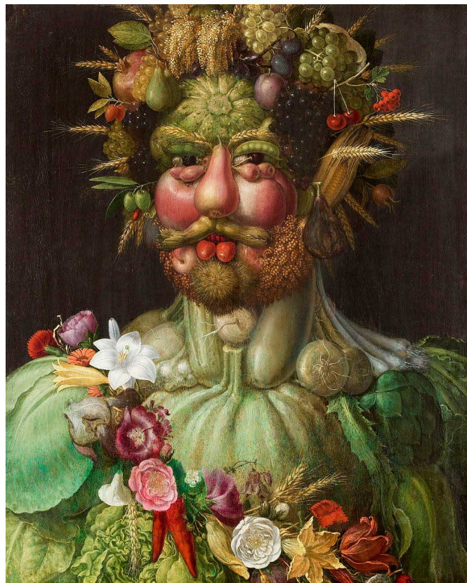
Giuseppe Arcimboldo, Feast for the Eyes , 1590

On the back cover of the 2019 English edition of Coccia's book, Bruno Latour gives a somewhat back-handed endorsement. 'Back to animals! Back to mushrooms! And now back to plants!' Latour refers to the recent spate of popular writing on the nonhuman world, the sometimes-romantic 'post-Anthropocene' turn to nature in the arts and humanities. The reasons are obvious: humans have fucked up the planet, exalting our own presence, progress, and needs for centuries, and now we have no choice but to attend to what we've overlooked and destroyed.